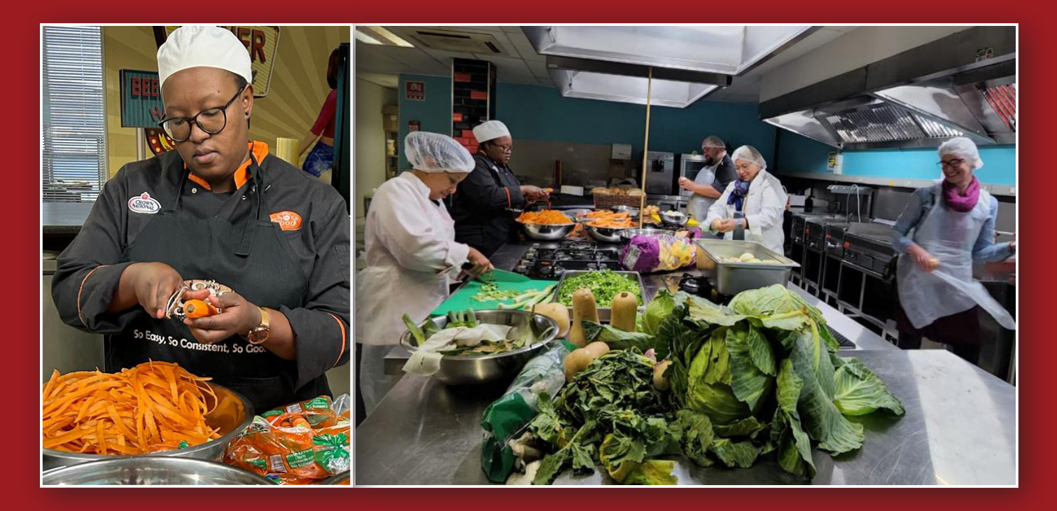
NORTHERN REGION - What can be a better way to celebrate Mandela day then to pull up your sleeves and serve others.